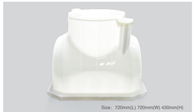
Size: 720mm(L) 720mm(W) 430mm(H)