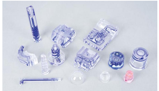
· Transparent resin parts