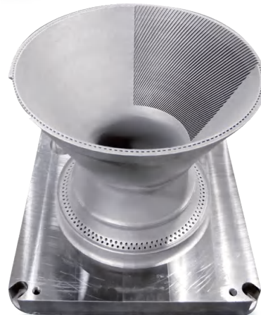
TC4 titanium alloy φ 393 X 340 mm