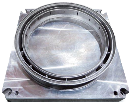
Engine leaf ring structure 316L φ 400 X 60 mm